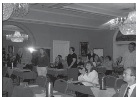
Members of the National ROMA Peer-to-Peer Training Program.

- Candidates participate in a group classroom session to demonstrate their ability to deliver two modules and discuss issues and concerns that trainers may have.